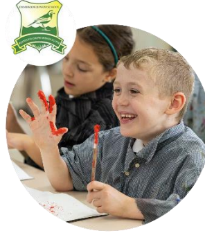
Emmbrook Junior School