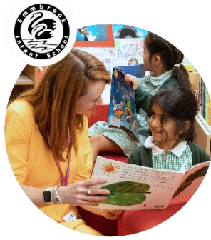
Emmbrook Infant School