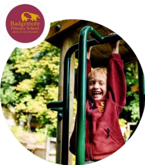
Badgemore Primary School

As a trust we are rooted in this approach and our ambition is clear; to improve the educational outcomes for children and young people. We don't want to change schools; we want to help them progress.