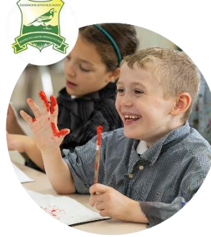
Emmbrook Junior School