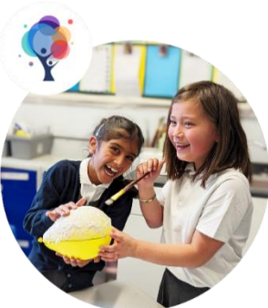
Nine Mile Ride Primary School