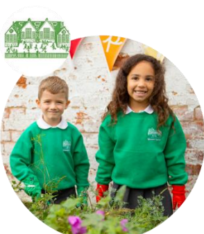
Wescott Infant School