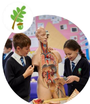
Westende Junior School