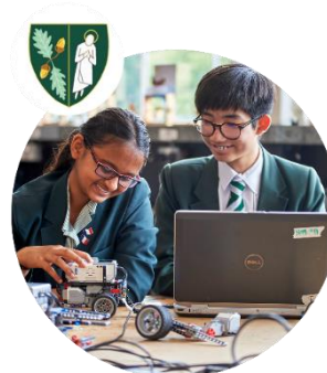
St Crispin's School