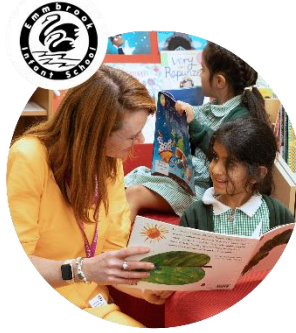
Emmbrook Infant School