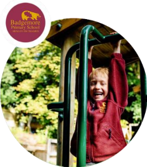
Badgemore Primary School

As a trust we are rooted in this approach and our ambition is clear; to improve the educational outcomes for children and young people. We don't want to change schools; we want to help them progress.