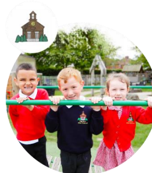
Shinfield Infant and Nursery School