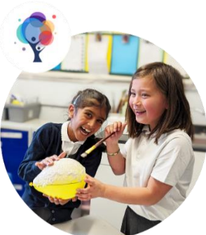
Nine Mile Ride Primary School