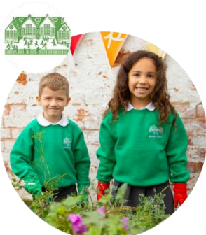
Wescott Infant School