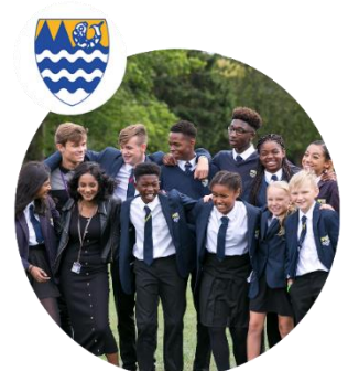
The Emmbrook School