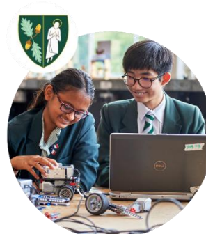
St Crispin's School