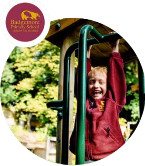
Badgemore Primary School

As a trust we are rooted in this approach and our ambition is clear; to improve the educational outcomes for children and young people. We don't want to change schools; we want to help them progress.