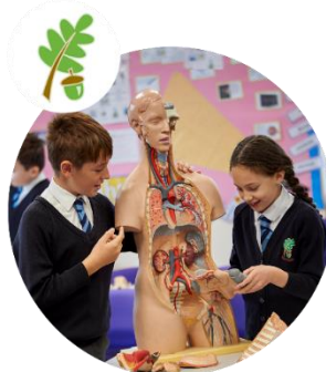
Westende Junior School