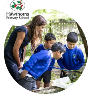
The Hawthorns Primary School