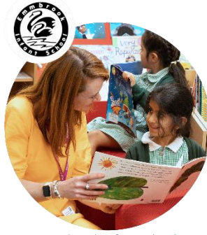
Emmbrook Infant School