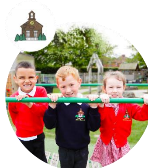
Shinfield Infant and Nursery School