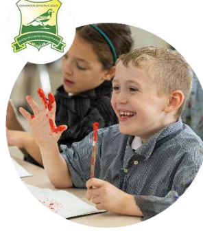
Emmbrook Junior School