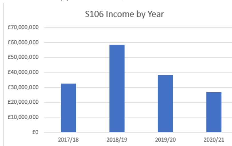
Figure 1: S106 income by year since 2017/18

The funding for 2020/21 was secured through a number of different sites across the borough, ranging from large to small developments. The main sources of funding came from the following sites for 2020/21;