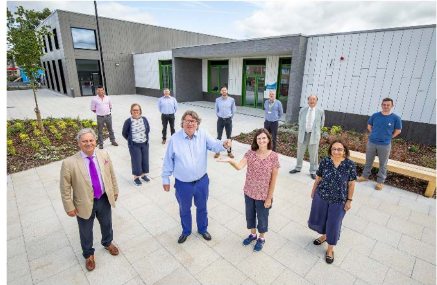
Farley Hill Primary School staff receiving the keys to their new site in Arborfield