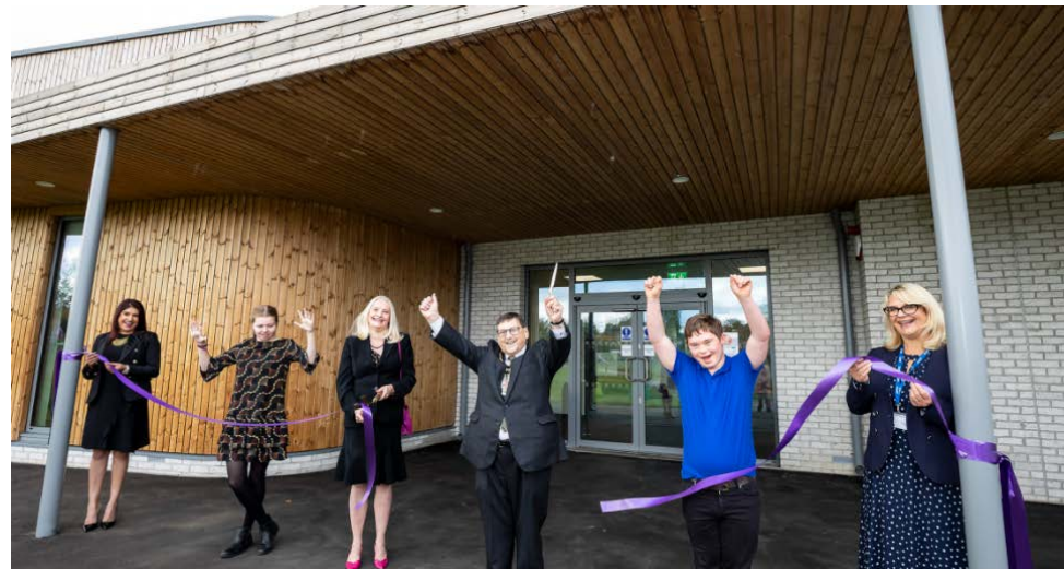
Opening of the new Sixth Form building at Addington School, Woodley.

Over £1.1 million of CIL funding was used in the expansion of Addington School, Woodley. The expansion will allow 50 more local children with special educational needs and disabilities to be educated closer to home, with the school's capacity boosted to more than 250 students due to the extra space.