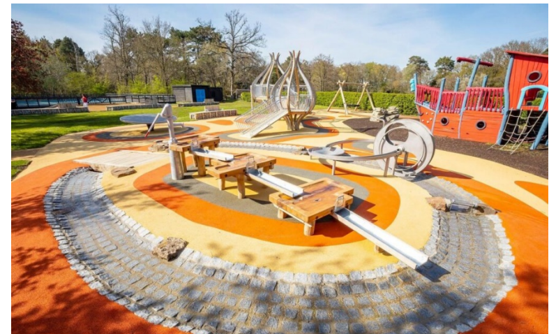
Sensory Garden at California Country Park Play area