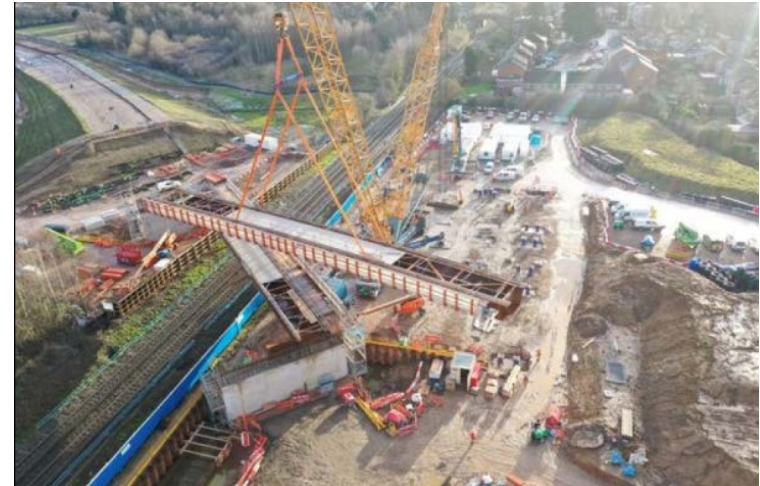
New bridge over railway for North Wokingham Distributor Road

These dualling works have taken place to accommodate the forecast traffic, which will be introduced by the completion of the Winnersh Relief Road (WRR). The existing footway/cycleway has been realigned and a new footway added to the eastern side of the road.