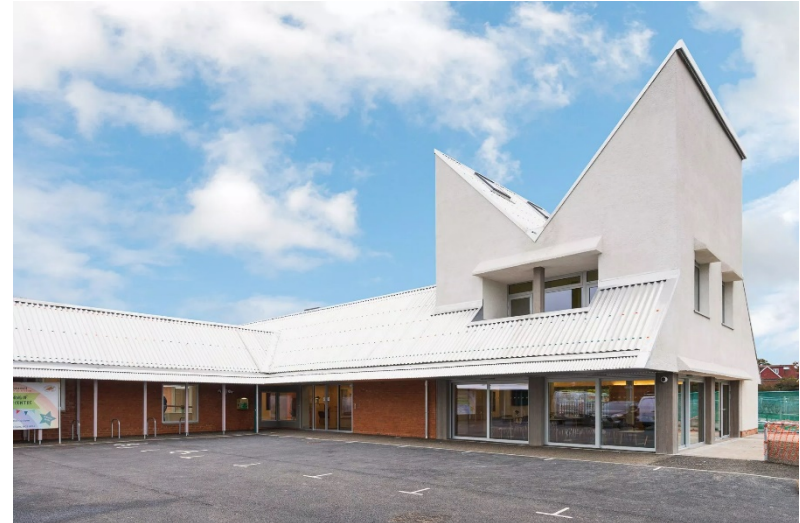
New Shinfield Community Centre (School Green Centre)