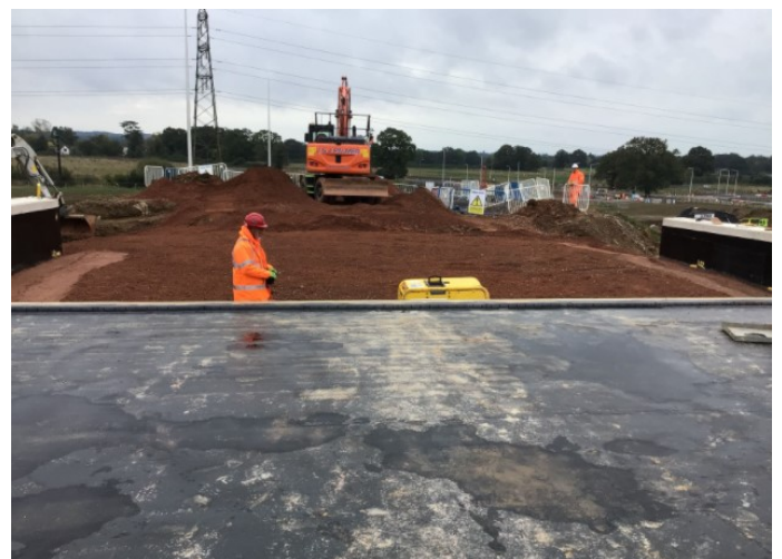
Above Left photo shows the wheelchair access ramp being constructed along the wingwall.