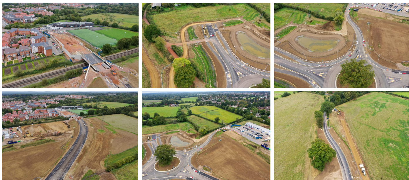
Aerial view of the new roads, roundabout, ponds and the realigned stream.