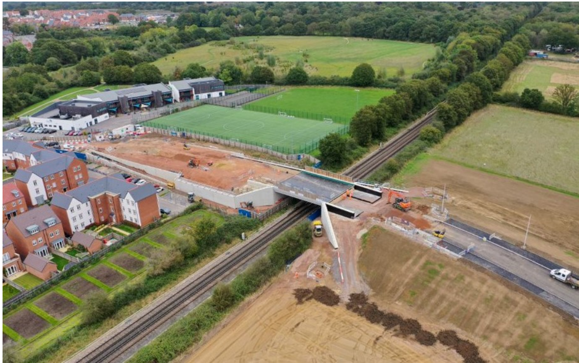
Aerial view of the new railway bridge and works being carried out to prepare the new road for the laying of the final road & footpath surface.

With the North and South wingwalls constructed and the bridge in place, the project team worked hard to complete the “Backfill” operation. This work has now been successfully completed to plan. The focus now is to complete the surface area that links the new sections of road to the new bridge and then lay the final road & footpath surfaces.