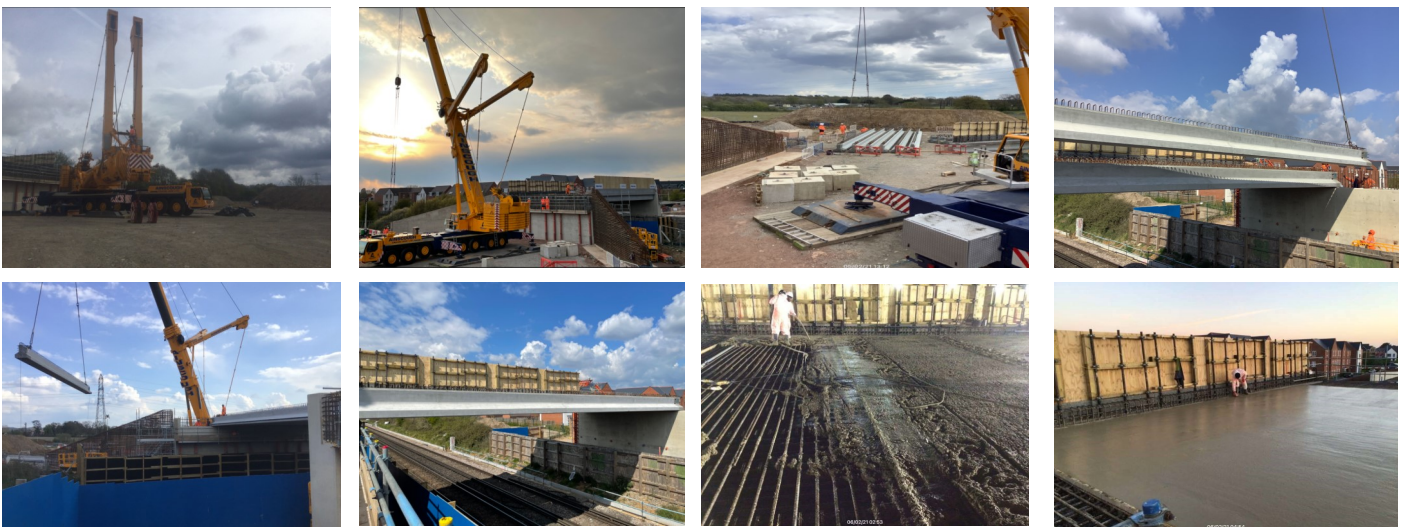
Above photos were taken during the process to install the bridge beams and the pouring of concrete on to the new deck. Many months of planning ensured a successful result.