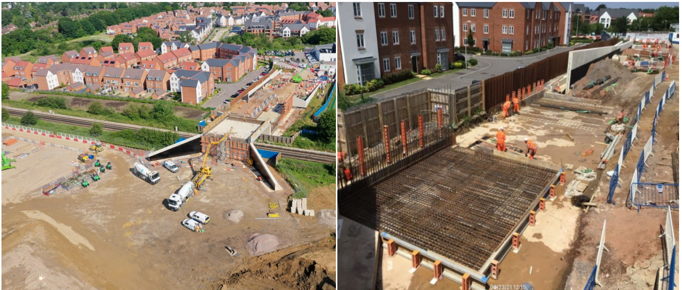
Aerial view of the new railway bridge and works being carried out on the wingwalls towards the abutments.

The North and South abutments which support the bridge beams, were constructed to plan to allow the bridge beams to be lifted into place in the early hours of 3rd May 2021. The lifting operation was carried out by one of the largest mobile cranes in the UK. Since the bridge beams were installed, the team have poured concrete to create the bridge deck and the bridge wingwalls are also near to completion. The next milestone , will be to 'Backfill' and tie-in the new roads to the new bridge, this work will commence this later month.