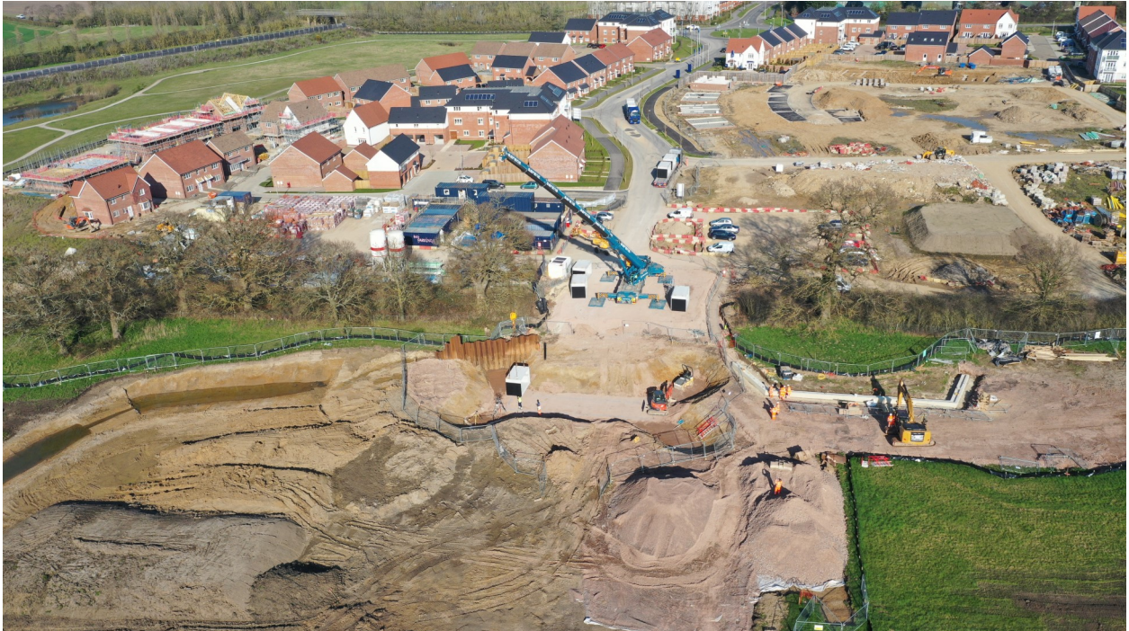
Aerial view of Ashridge Stream

The project includes the diversion of the Ashridge stream. In order to keep and protect the trees, sheet piles were installed to avoid affecting the roots during the construction of the new stream. A culvert is being installed to allow the construction of the road on top of it. Also, two new ponds will be built at the North of the road to take all surface water, creating a new area for the local species.