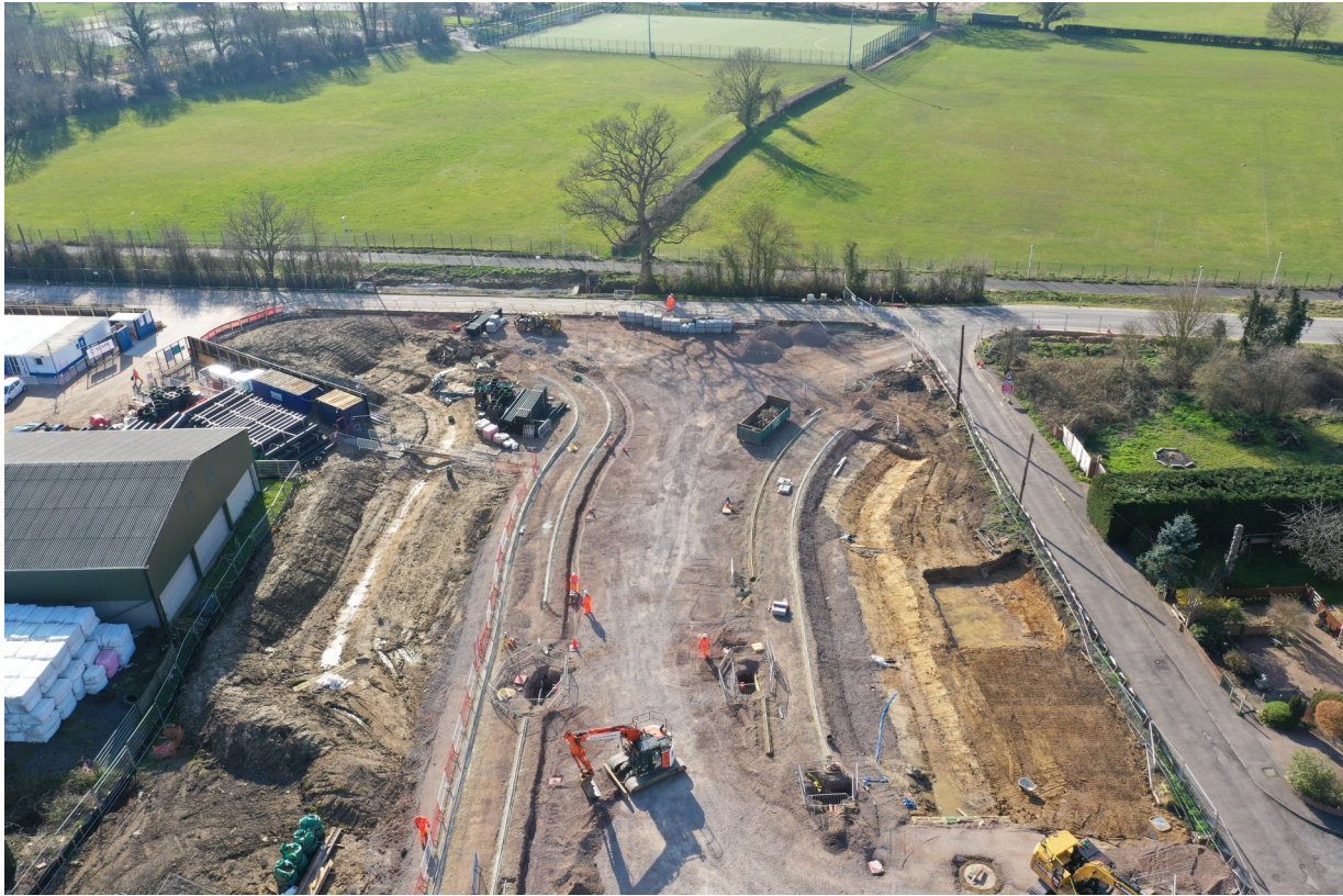
Aerial view of the new road tie-in at Bell Foundry Lane.

Works are progressing well to “tie-in” the new road with Bell Foundry Lane. The drainage system has been installed underground and work now continues to level the road surface, install the new kerbs and commence the laying of the road surface.