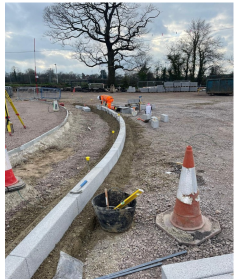
Works ongoing to install new drainage and kerbs at both sides of the new road that links into Bell Foundry Lane.