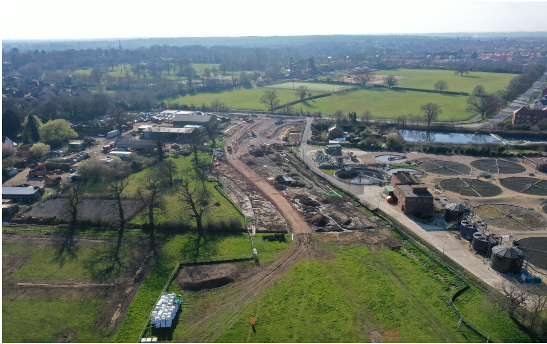
Aerial view of the new road.

The new carriageway will be 7.3m wide with footpaths and verges at both sides of the road. The scheme allows for seeding and planting of the embankments and verges to integrate the new infrastructure with the aesthetics of the area.