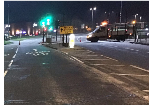
Actions identified through the recent road safety audit and inspection were addressed during a short period of overnight works last month