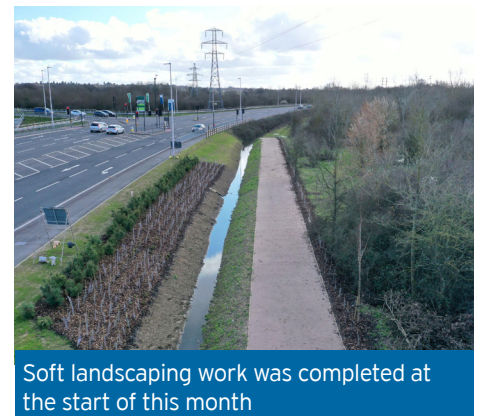
Soft landscaping work was completed at the start of this month