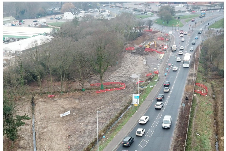
An aerial view of the old Lower Earley Way