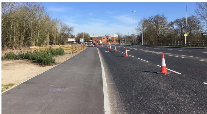
Finished footway surfacing