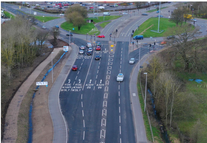
An aerial view of the new-look Lower Earley Way Dualling