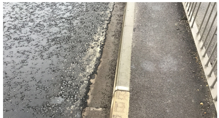
Reduced footway construction thickness

While this scheme is now complete, we have decided to keep the dedicated inbox active and we welcome your feedback. If you know of anyone in your local community who does not have access to the internet but would still like to receive this and related updates then please let us know. A reminder of the scheme e-mail WRR@balfourbeatty.com which is monitored regularly. Alternatively, you can also contact our central helpdesk on 0800 121 4444 .