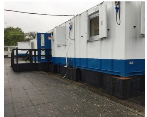
Cabins lifted to avoid flooding