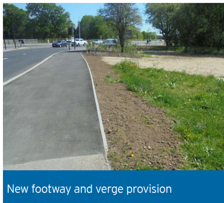
New footway and verge provision