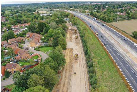
Longdon Road to Reading Road link