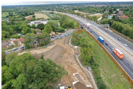
North roundabout on Reading Road