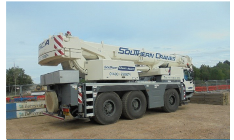
An example of the type of crane that will be required for the installation of sheet piling