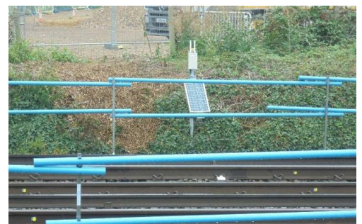
The track monitoring devices will measure track movement during the main construction works. They have been installed on the rails and are fitted with solar powered transmitters. The transmitters send data to a computer. This modern system eliminates the need for manual surveying as well as potential risks