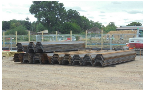
The sheet piling will support the existing ground along the railway during the new bridge construction