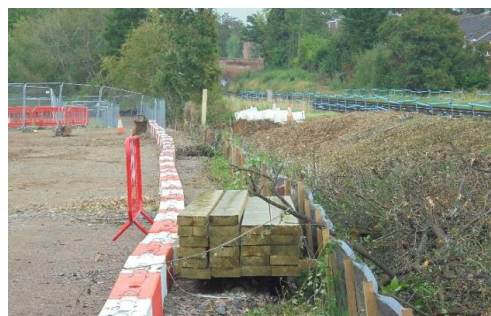
Red-white blocks linked together forming a barrier as a safety measure before timber hoarding is installed to prevent excavators and vehicles from encroaching into the railway boundary

As we draw closer to the winter months, temporary lights are to be installed for the safety of the public and our workforce. These energy efficient sensor-controlled lighting will automatically switch on daily during darker periods of the day and night.