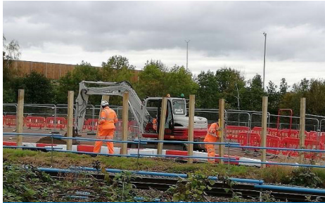
New swale cut through the site to allow for improved drainage of the road