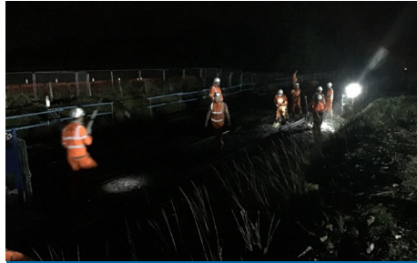
Overnight works which included site clearance, installation of fencing and a track monitoring system were carried out along the railway track.