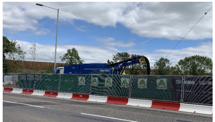
The asset mass barrier on Reading Road is a protective steel barrier consisting of hot galvanised elements powder coated in highly visible safety colours. Individual base units weigh 55kg and each unit links together via vertical pins