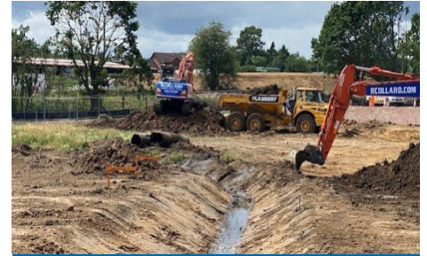
New swale cut through the site to allow for improved drainage of the road