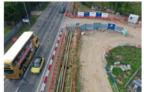
Uncovered utilities on Reading Road