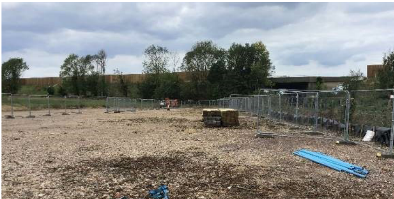
Special fencing and track monitoring devices have been installed on the rails along the train track to enable the earthworks in preparation for the new bridge over the railway