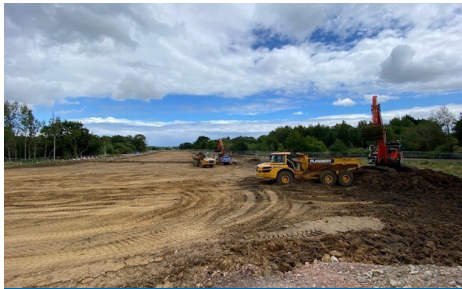
Top-soil strip along a section of the new Distributor Road