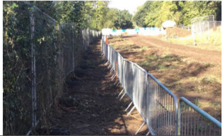
Winnersh Relief Road safety measure: A temporary pedestrian walkway has been installed through the northern roundabout site. This helps to create a visual exclusion zone between plant and pedestrian