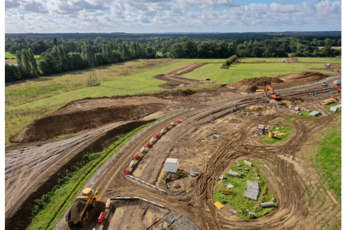
Photo on the right shows works at the junction of Park Lane/Nine Mile Ride. These works included install of new drainage systems, connection of new utility supplies to existing supplies and tiein of the new road to the current junction. The junction was reopened at the end of October 2021.

Main construction works are well underway at a number of locations across the sites, focusing initially on the bulk earthworks and drainage works as well as working with the utility companies to install and divert all the necessary services such as gas, water and electricity. As you can see, works have progressed to the extent that the beginnings of what will become the new road alignment are starting to take shape on the ground.