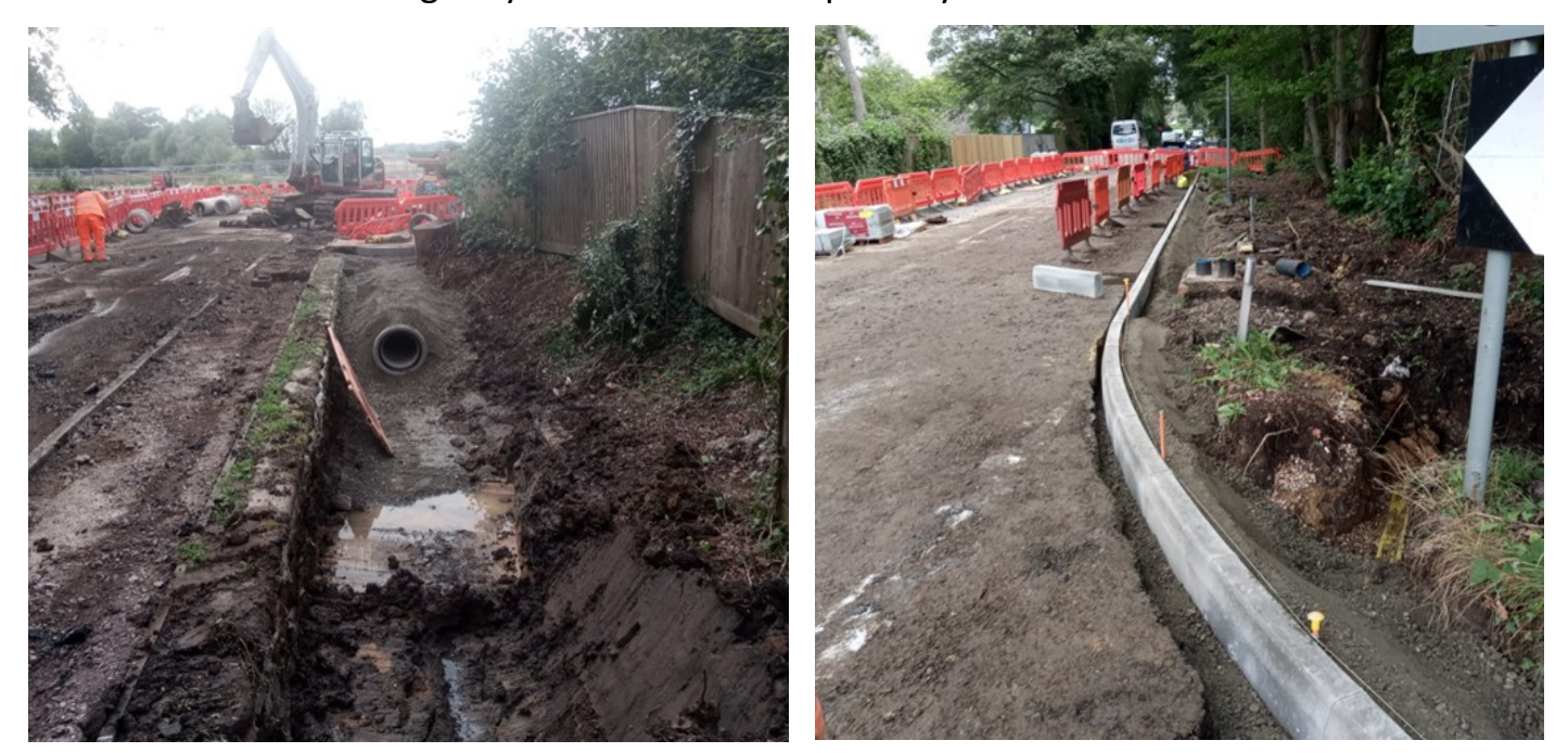
Photo above Left: New drainage system being installed in at the Park Lane/Nine Mile Ride junction. Photo above Right: The new kerbs being installed to the new levels at the Park Lane/Nine Mile Ride junction.

The Park Lane/Nine Mile Ride junction as planned was closed for an extended period whilst ducting installation works were carried out to enable future streetlighting. A new drainage system has also been installed and new kerbs are now also in place to allow for the new road alignment works to commence. The junction was recently re-opened at the end of October 2021 and the new carriageway is on track to be in place by March 2022.