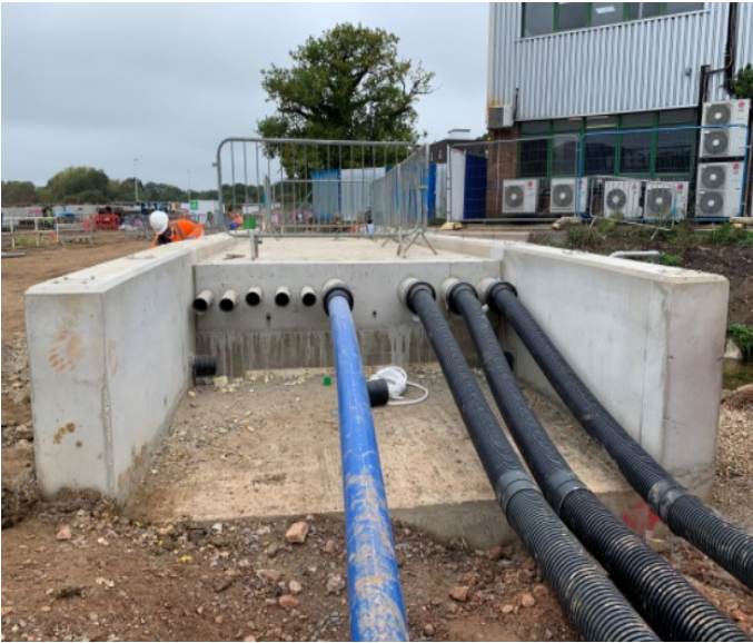
Photo top left: New utility supplies being installed through the new walkway/bridge at Toutley Road.