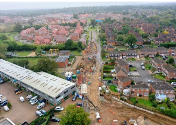
Photo bottom right: Work has started to link Old Forest Road to the new road, with new kerbing already in place.

Photo bottom left: Alleviation works including erection of a new Kingpost Wall near homes in Summerfield Close has been installed. This will allow the new culverts to be installed.