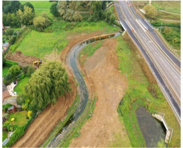
Photo top right: The Emmbrook stream diversion and associated earthworks have been completed.

Photo top left: New utility supplies being installed through the new walkway/bridge at Toutley Road.