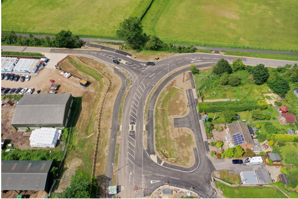
Aerial view of the newly constructed section of road that ties into Bell Foundry Lane.

When complete, the new carriageway will be 7.3m wide with footpaths and verges at both sides of the road. The scheme allows for seeding and planting of the embankments and verges to integrate the new infrastructure with the aesthetics of the area.