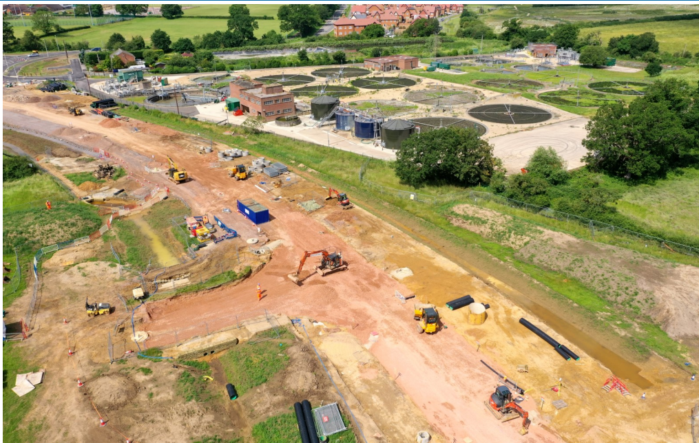
Aerial view of the new section of road being constructed, when complete, will tie Bell Foundry Lane to Dalley Road.