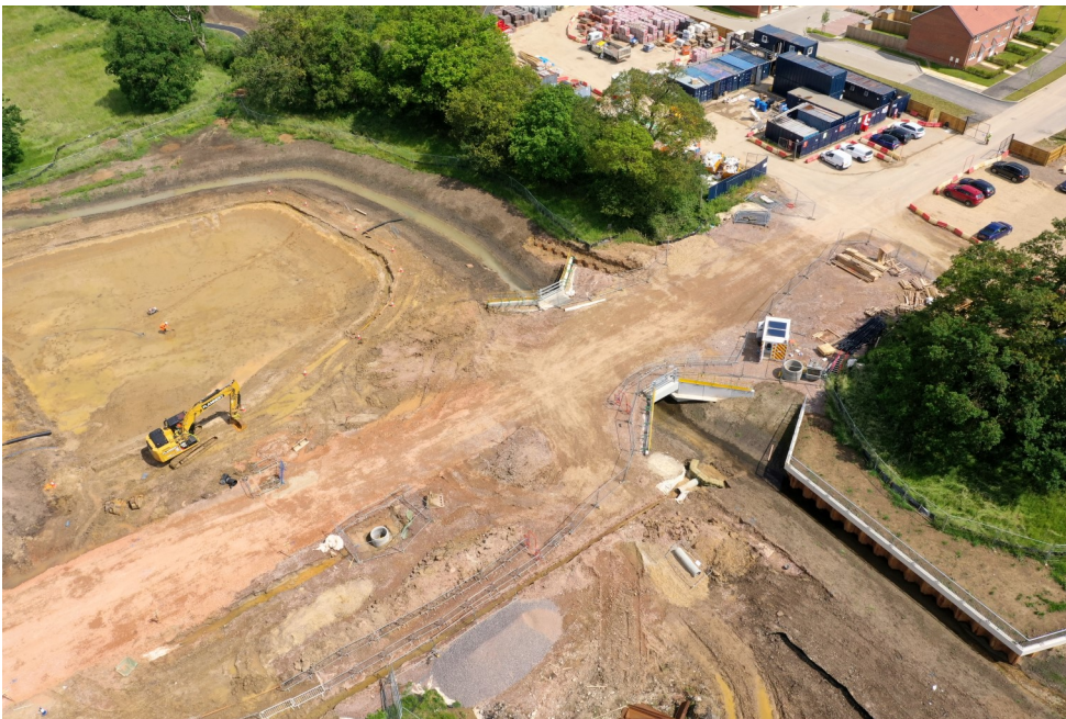
Aerial view of the 'New' Ashridge Stream, newly installed culvert and surrounding ponds.