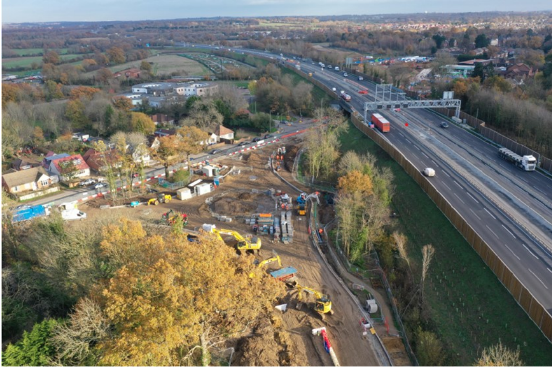
Aerial view of the new northern roundabout linking onto Reading Road (Adjacent to the M4)

Works at this new junction progressed well including the installation of drainage pipes, electrical and communication cables