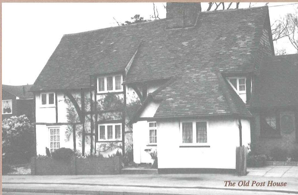
The Old Post House