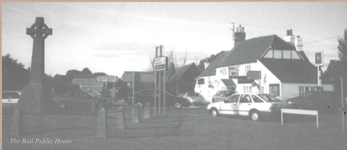
The Bull Public House