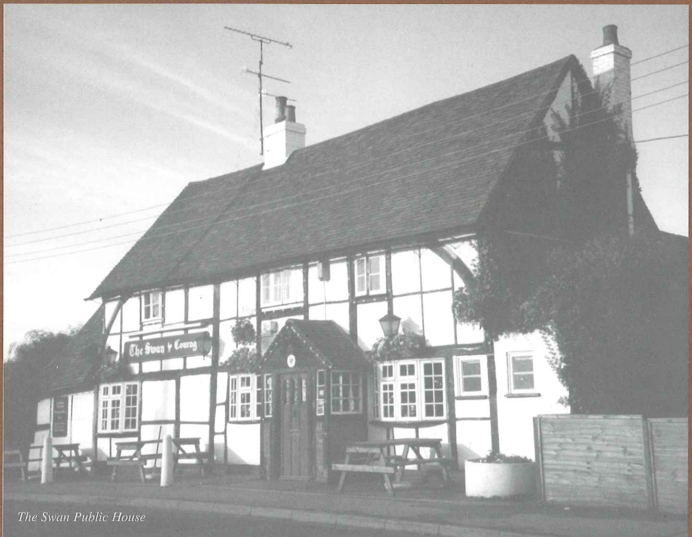
The Swan Public House

The Arborfield Cross Conservation Area is focused on the crossroads and extends to the south along the A327 Eversley Road. It includes Newlands farm to the north of the intersection.