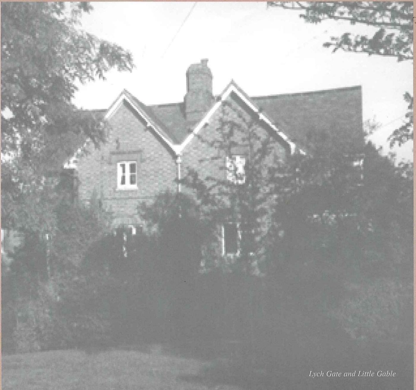
Lych Gate and Little Gable

A group of buildings had already been established at, or near the crossroads by the c15, with the two coaching inns creating a centre for trade for the local farming community and travellers.