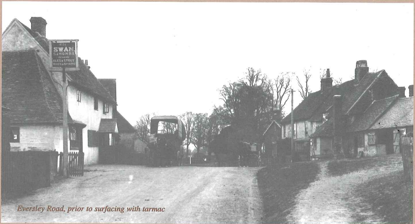
Eversley Road, prior to surfacing with tarmac