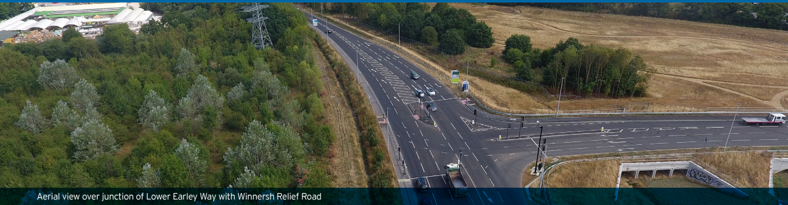
Aerial view over junction of Lower Earley Way with Winnersh Relief Road

We are pleased to introduce the first of a series of newsletters on the Wokingham Major Highways Programme. We encourage questions you may have about this programme, as well as your comments, suggestions and feedback on any aspect of this programme. You can find our contact details overleaf.