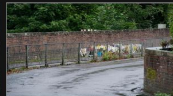
Tragic train death teenager named