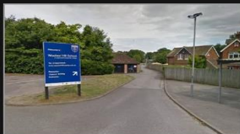
School's touching tribute amid shock