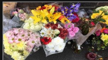
See beautiful floral tributes to teen