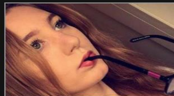
Family issue heartbreaking tribute